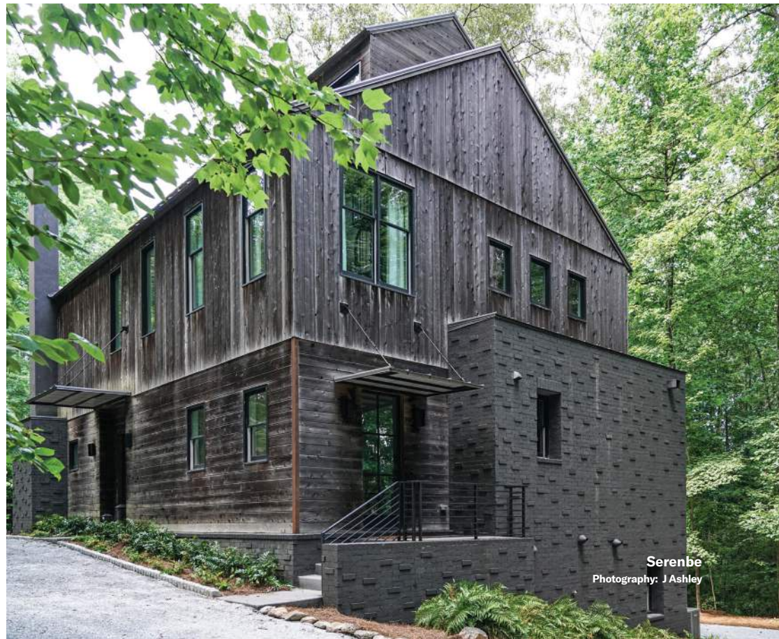
Serenbe Photography: J Ashley

Atlanta: Saturday October 21 & Sunday October 22 10am – 4pm both days Some commercial locations require separate ticket for guided tours Tickets: $45 per person