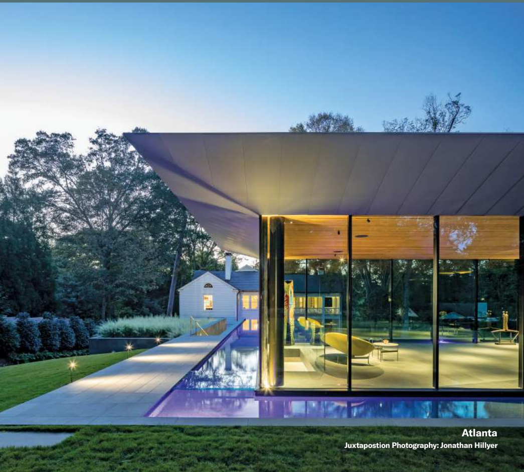
Atlanta Juxtaposition