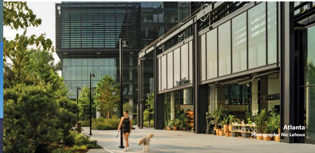
Atlanta Photography: Nic Lehoux